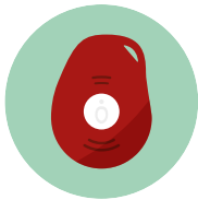
BuddyButton (GPS tracker)